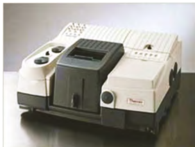
FTIR - Spectrometer