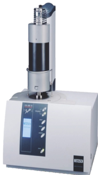
Simultaneous TG - DTA / DSC Apparatus