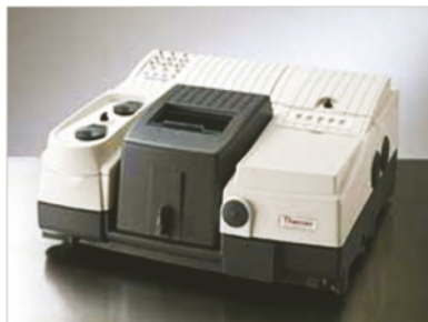
FTIR - Spectrometer